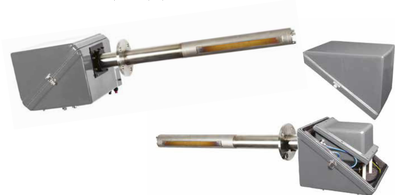
Coal Fired fitted with Flue Gas De-Desulphurisation (FGD) Scrubber